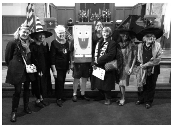
Continued on page 12