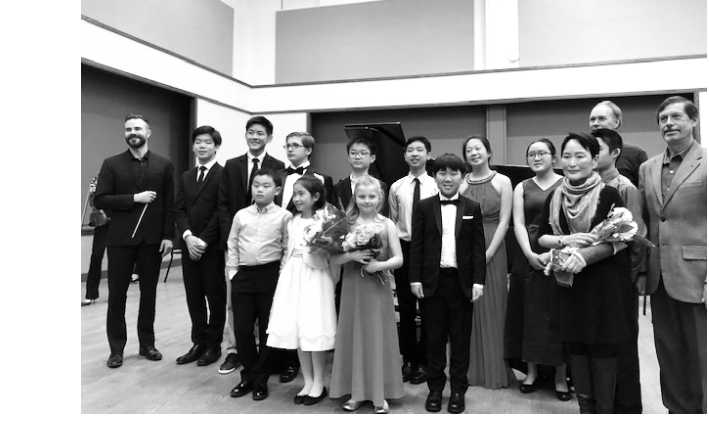
2 pm concert