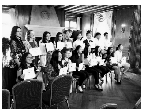
Senior Recognition Award