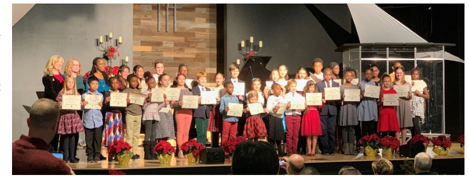
AAMTA Holiday Festival 2019

Students filled exciting recitals with a variety of solo and ensemble performances at the Holiday Festival in December. The event was held at Riva Trace Baptist Church in Davidsonville. Traditional holiday carols and other seasonal favorites were heard in arrangements for solo piano, piano duets, and trios.