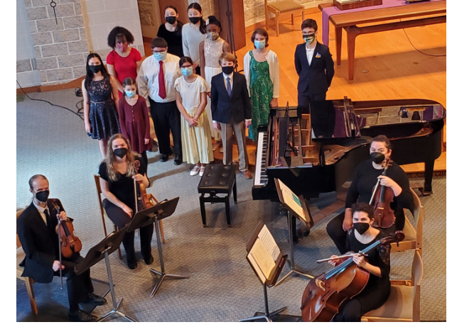
AAMTA Chamber Music Festival

Most recently, we held the Chamber and Ensemble Music Festival and Solo Piano Festival. The Ensemble Music Festival featured performances on piano, cello, percussion, and ukulele. Students of all levels collaborated with friends, teachers, siblings, and parents for traditional classical repertoire as well as arrangements. Intermediate and advanced students performed with the Londontowne Symphony Quartet for the Chamber Music Festival, where they enjoyed learning about collaborative skills and leadership skills while delighting the audience.