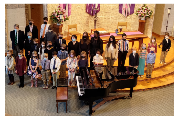
AAMTA Ensemble Music Festival

In May, we held our Spring Piano Solo Festival, in which students filled five recitals for two large elementary recitals, a middle school non-competitive recital, and competitive events for middle school and high school students. Our students are currently preparing for the Nature and Water Music Festival in July.