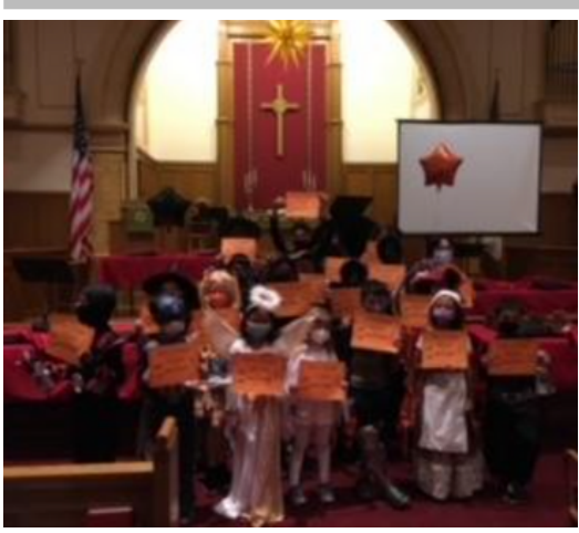
One of the three FCMTA Halloween Student Recitals 2022

Frederick County Music Teachers Association was able to offer all of the scheduled student and teacher programs in 2021-2022! We consider that a great success as we move forward learning to navigate in the health climate of our times.