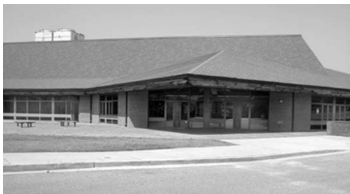
Montgomery Hall (Music and Arts)

Renaissance Spain is remembered today for conquering the New World, supporting the