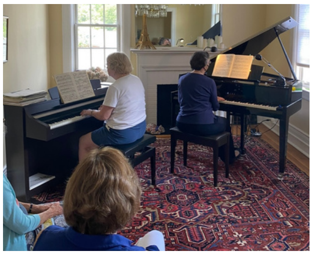
10th Anniversary Matinee