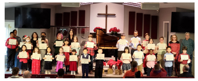
Holiday Program, Severna Park Baptist Church, December 2022