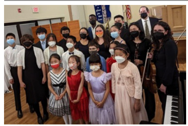
Honors Concerto performers from the Orchestra Concerto Competition