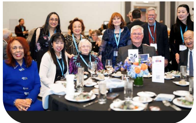
Greetings from Chicago!