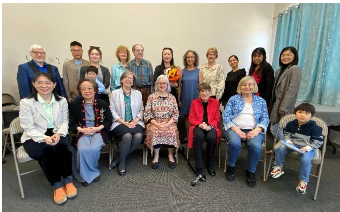
MCMTA May General Membership Meeting at Jordan Kitt's Music in Rockville