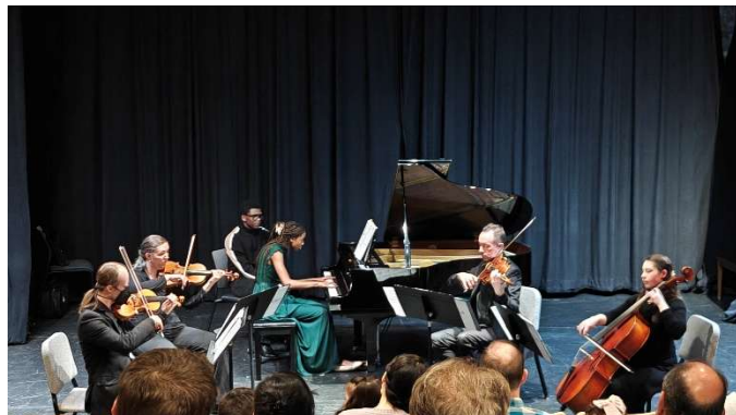
AA-ASMTA Chamber Music Concert

CCMTA Solo & Ensemble Festival Recital: Saturday, February 28, 2026 took place at Carroll Lutheran Village, Krug Chapel at 3:00pm. 27 students from the studios of six